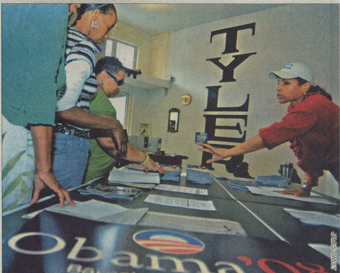
Volunteers hand out information during the days leading up to the primary election held on Tuesday. Voter turnout was very high in the tightly contested Democratic presidential primary.